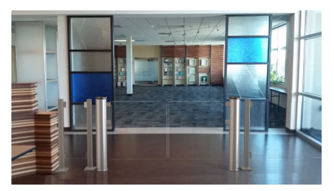
SwingGate SG525 Saloon Style (Shown with optional clear infill barriers)

(34" ADA opening with custom dimensions available)