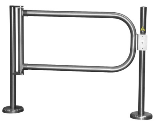
SwingGate SG100 (36" ADA or custom sized widths from 20"-60")

Call: 203-647-9147 Email: sales@haywardts.com Website: www.haywardts.com