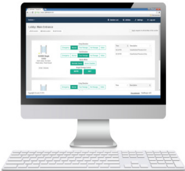
EZ Lane SL2000 LaneAdmin Software on a PC

Reports (Excel, CSV, PDF) are also easily extractable with LaneAdmin, allowing you to analyze turnstile activity like alarm conditions and traffic flows to get the best out of your turnstile access control system.