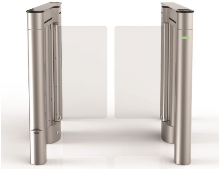
Control your EZ Lane SL2000 remotely from any device

The LaneAdmin Remote Monitoring Software is a browser-based software that allows you to take control of virtually all the day-to-day operational functions of our EZ Lane SL2000 optical turnstile. Whether you use a laptop, PC, or tablet, our LaneAdmin allows you to remotely control your SL2000 seamlessly.