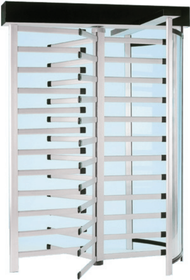
HT80 Standard Passage