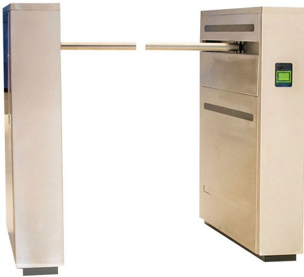
EZ Lane Swing Arm (28"-36" ADA opening)

Mid-Range Optical • Basic Security • Single/Double Arm Swing Barrier Bi-Directional • Tailgate Detection • Crawl Detection • Full Alerts