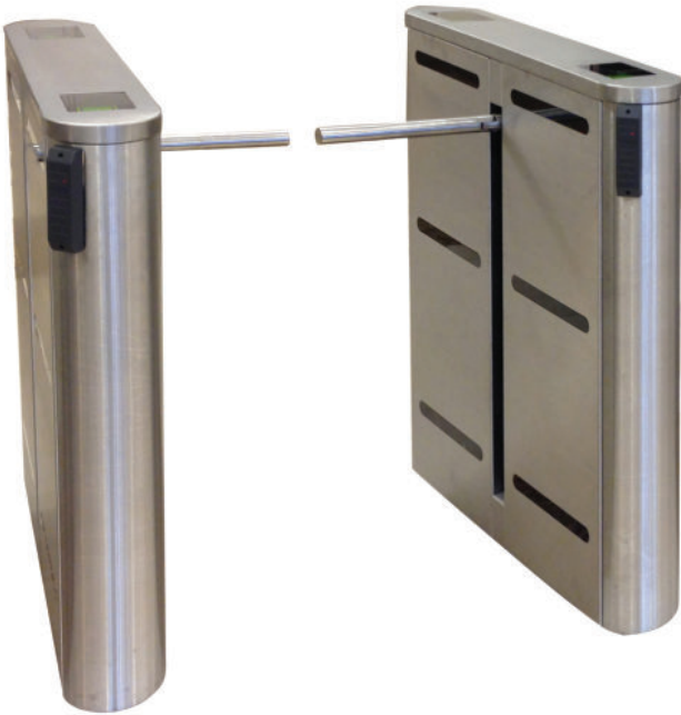
EZ Lane Drop Arm (22"-36" ADA lane widths)

Mid-Range Optical • Drop Arm Barrier • Bi-Directional • Card Stacking Tailgate Detection • Crawl Detection • Full Alerts