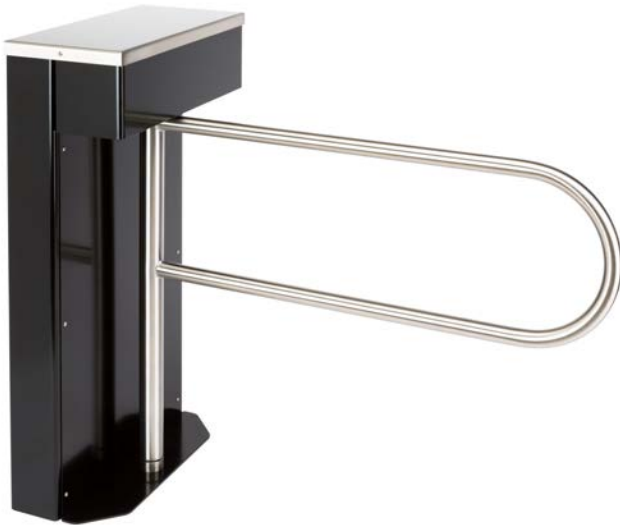
SwingGate LC150 (36" ADA opening)

Affordable Value • Improved Design • One or two way swing • Fixed ADA size