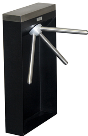
Matching LC100 Tripod Turnstile May be installed together for complete ADA-compliant solution

Our Hayward Turnstiles access control specialists can coordinate installation with someone from our nationwide database of certified partner installers. Our partner installers are willing to provide you with an entire turn-key quote where they will handle purchasing, delivery, installation, and integration for you.