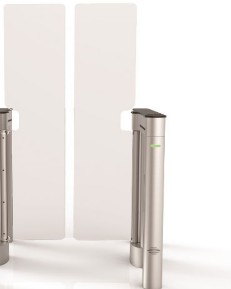
EZ Lane SL2000 High Barrier Option 69"

(35", 46", 69", & custom Heights Available)