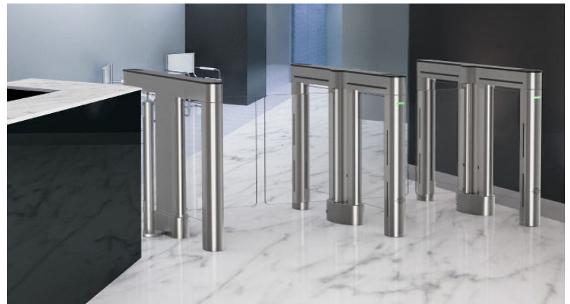
Modern design blends with any lobby (Cabinet Finish and Lid Color Options Available)

The SL2000's slim size and compact footprint saves floor space and allows use of optical turnstiles in areas where space is a premium.